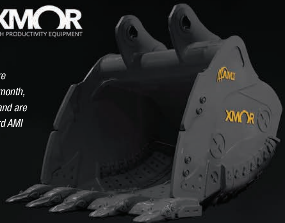
XMOR® BHC MINING BUCKET