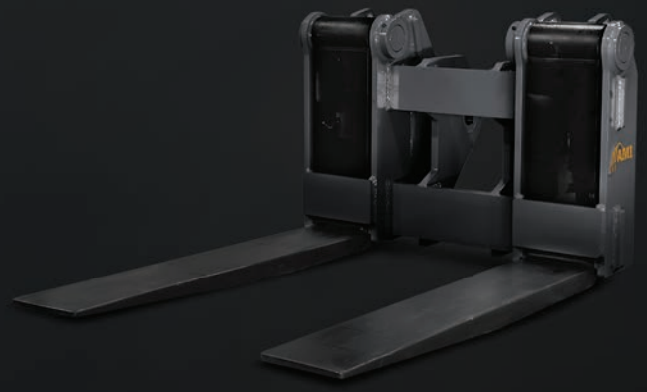
QUARRY EXTRACTING FORK RACK (SHAFT TYPE TINE)