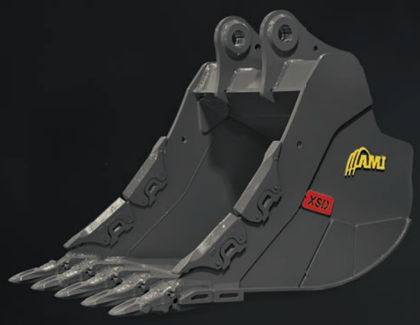
EXTREME SERVICE DIGGING BUCKET