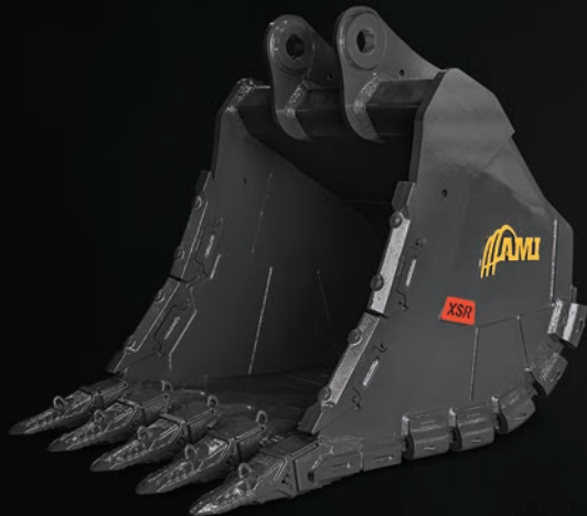
EXTREME SERVICE ROCK BUCKET

BHB & BHC buckets are subject to XMOR® 14 month, 4800 hours warranty and are excluded from standard AMI 2 year warranty.