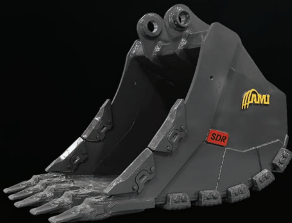
SEVERE DUTY ROCK BUCKET