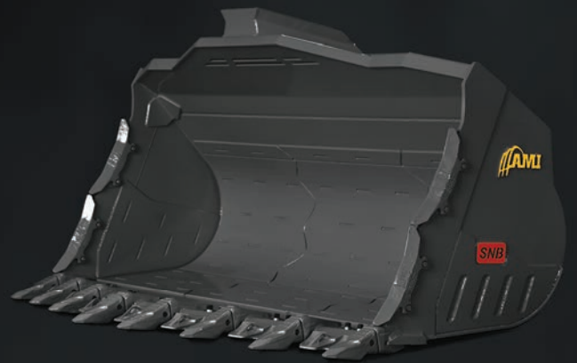
SEVERE DUTY SPADE NOSE ROCK BUCKET