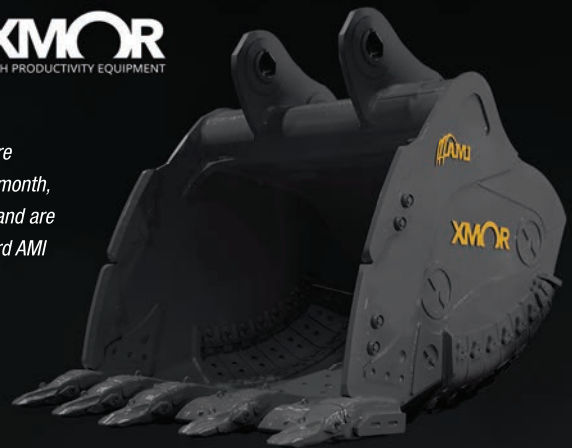
XMOR® BHC MINING BUCKET