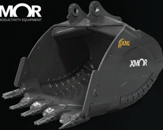
XMOR® BHB MINING BUCKET