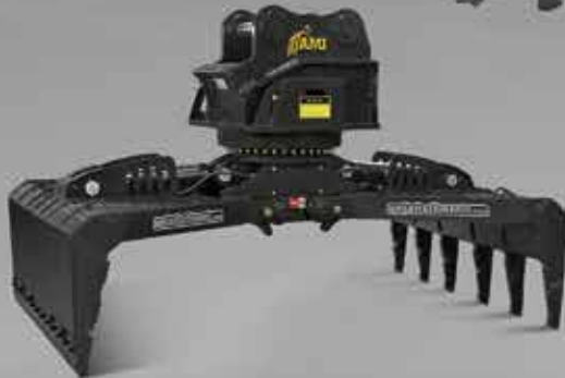
EXCAVATOR / LOG FORWARDER / LOGGING TRUCK