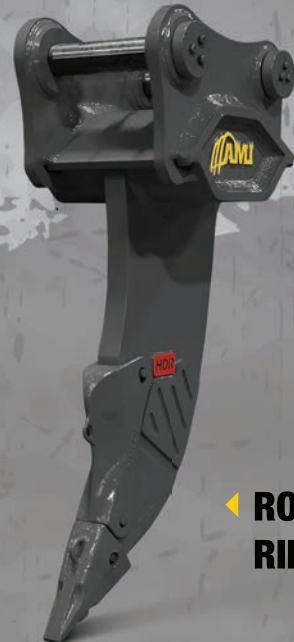
◀ ROCK RIPPER