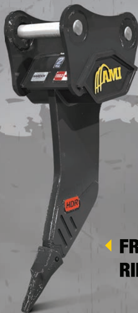
◀ FROST RIPPER