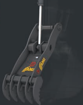
LETSDIG18 STICK PIVOT HYDRAULIC THUMB