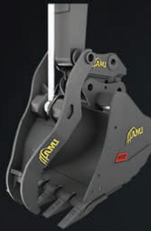
STICK PIVOT HYDRAULIC THUMB