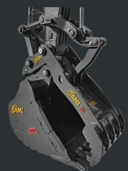
HIGH CAPACITY HYDRAULIC TILT DITCH CLEANING BUCKET