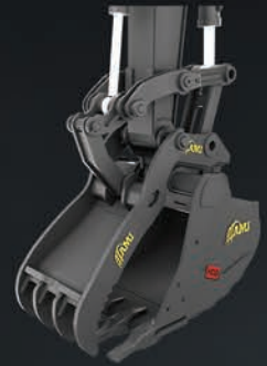
PROGRESSIVE LINK HYDRAULIC THUMB