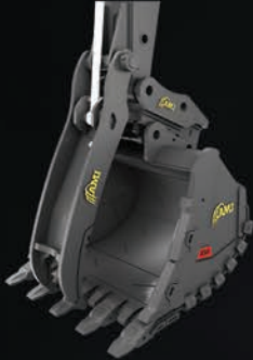
HYDRAULIC WELD ON THUMB