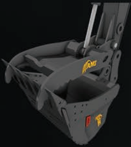
HYDRAULIC WELD ON THUMB