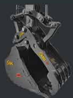
HIGH CAPACITY HYDRAULIC TILT DITCH CLEANING BUCKET