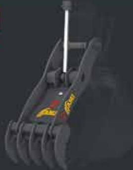
LETSDIG18 STICK PIVOT HYDRAULIC THUMB