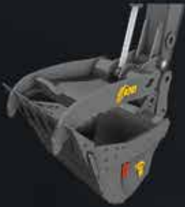
HYDRAULIC WELD ON THUMB