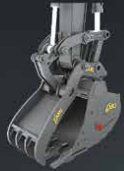
PROGRESSIVE LINK HYDRAULIC THUMB