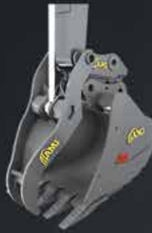
STICK PIVOT HYDRAULIC THUMB