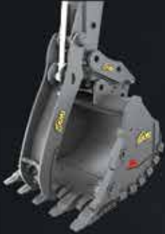
HYDRAULIC WELD ON THUMB